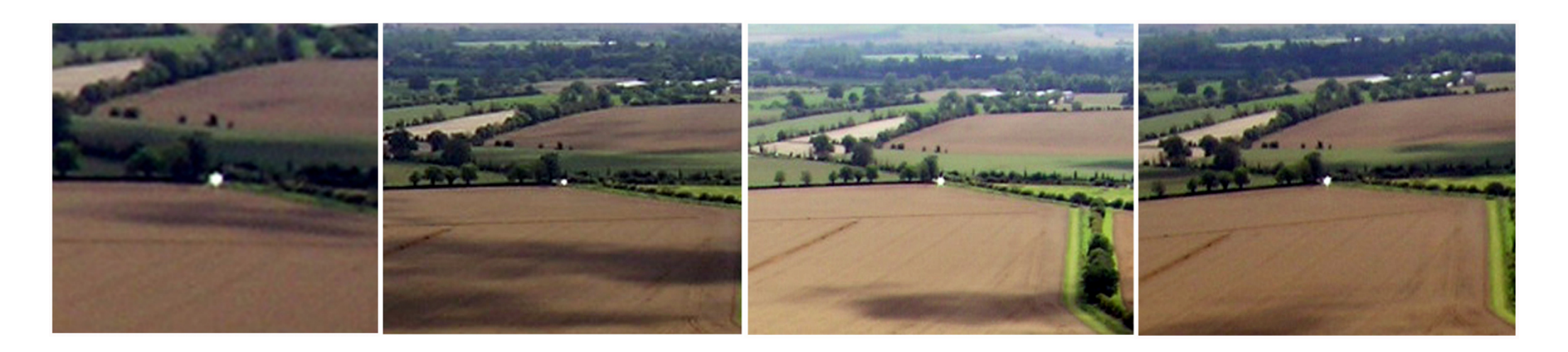
Here is the link to the video where we see the light at the end of the field : <a href="http://youtu.be/0T9CW_Ce6WQ">http://youtu.be/0T9CW_Ce6WQ</a>

This is a very important detail, because this light is visible on many of my photos :